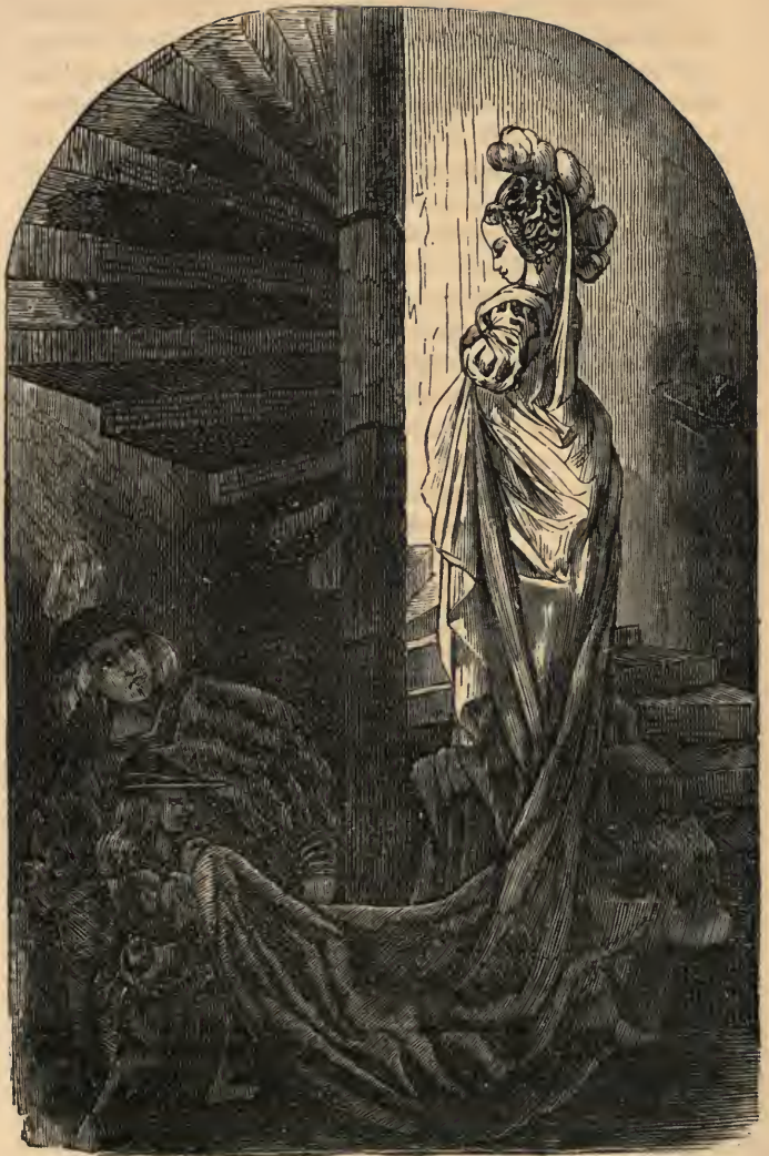
The High Constable's Wife.